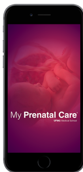
Figure 1. The My Prenatal Care app.

The human-centered design and development of systems require that apps be made usable and useful by focusing on the users [12]. Usable systems are beneficial for supporting an appropriate human-system interaction and fostering patient adherence [13,14]. In this context, communicability is an attribute of software that effectively conveys to users the underlying design intent and interactive principles [15]. The communicability evaluation method is an approach to evaluate the quality of the designer's communication with the user through the interface. Proposed by de Souza (2005), this evaluation allows the identification of communication breakdown with the computational artifact during user interaction [16]. We hypothesized that a positive perception of users on the in-app birth plan template is an essential step for establishing direct communication between pregnant women and the health care team at birth, based on an online report available on the app. With the early involvement of users in the prototyping phase of the interface, resolving communicability barriers would result in improvements that promote adherence to and foster the utility of this app. The present study aimed to validate an interface for birth-plan preparation in the My Prenatal Care app by examining interface communicability and the perceptions and experiences of a sample of the target population.